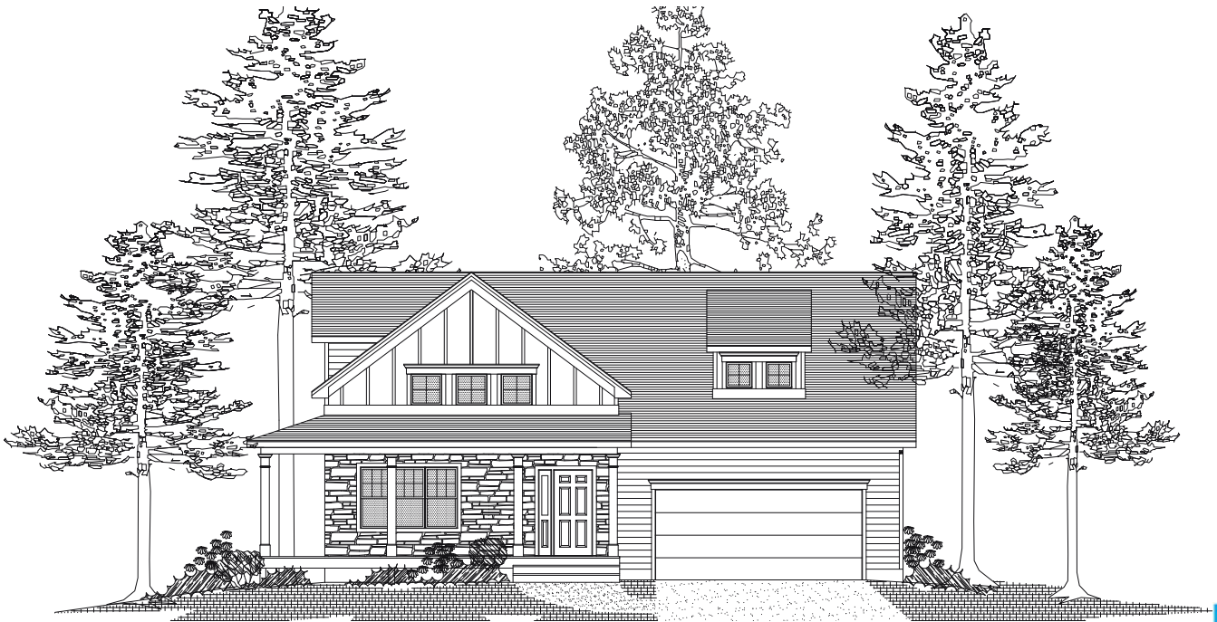
Photo shows an RGB Ambrose design rendering and may show optional features which vary from the standard plan. Refer to the floor plan for standard plan features which you may customize to make your new RGB home everything you want it to be.