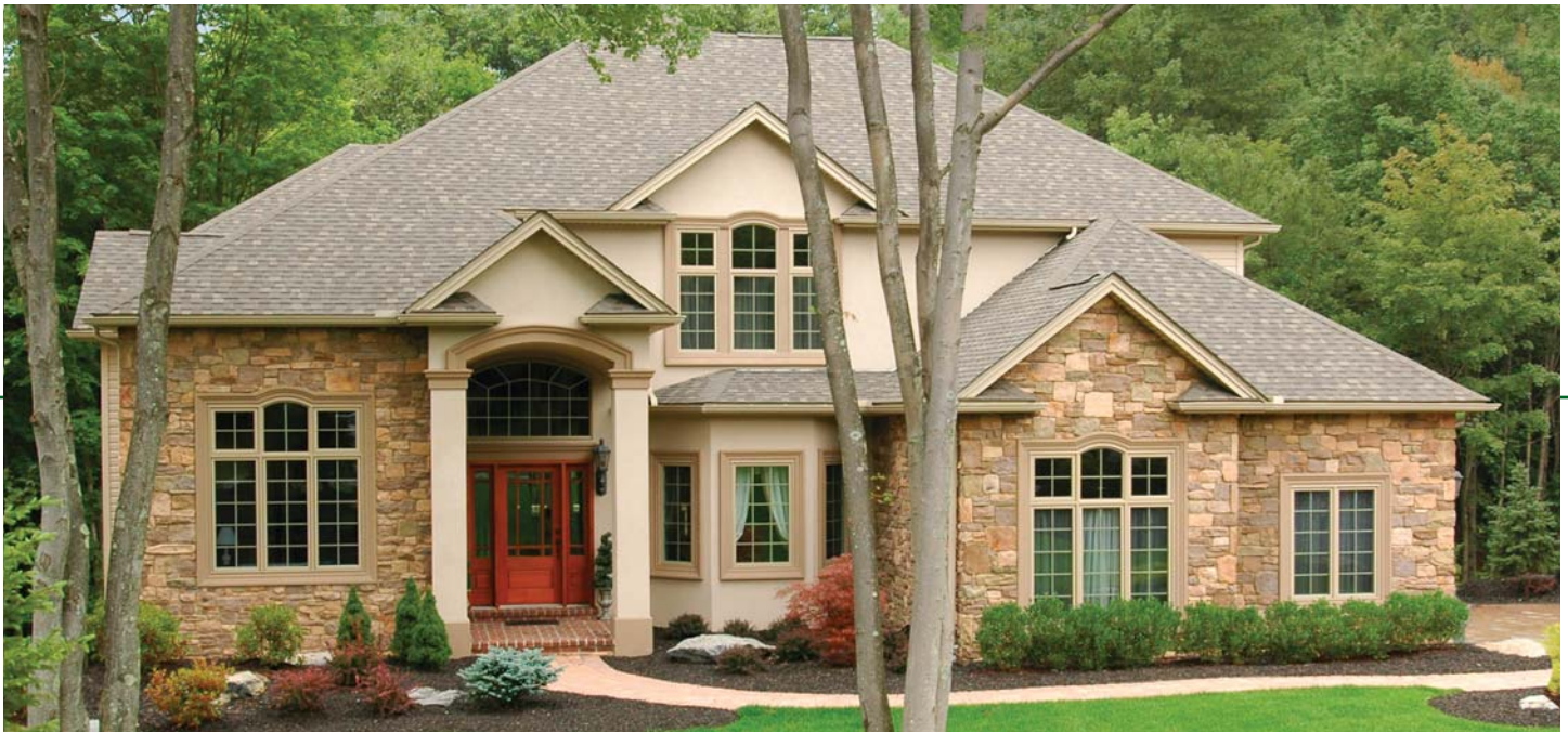
Photo shows an RGB Browning II design custom built for an individual RGB homebuyer and may show optional features which vary from the standard plan. Refer to the floor plan for standard plan features which you may customize to make your new RGB home everything you want it to be.